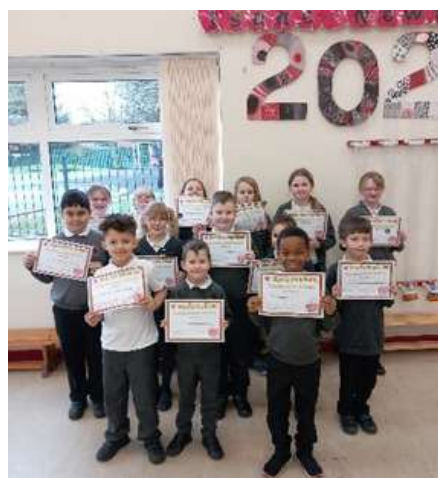
Winners from Celebration Assembly, with their certificates.