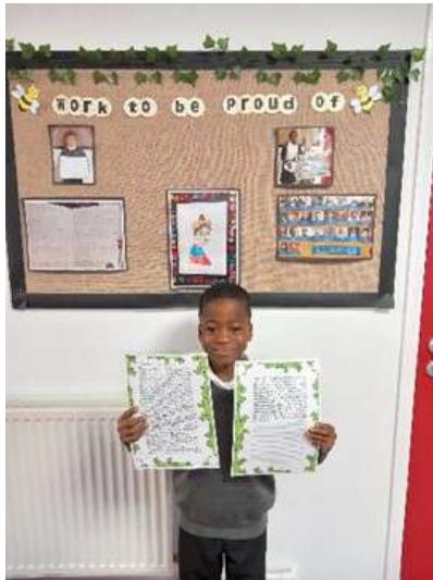
Class 8 Fairy tale pets. Well presented and fantastic sentence starters. Well done!